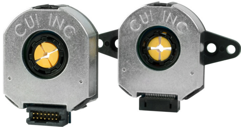
FIGURE 2 CUI's AMT encoder family is the first on the market to employ a digital ASIC-based design.

The incorporation of diagnostic capabilities into the rotary encoder provides the designer access to valuable system data that previously was not available in pure analog solutions. This data can be used to quickly allow the system to determine if the encoder is operating properly, has failed or become inoperable, or has become misaligned. The system can then use this data to inform operators of potential issues or to make informed decisions on its own before turning on the motor and causing potentially disastrous damage. Furthermore, engineers can use this feature for preventative measures - for example, executing an "encoder good" test sequence before running the application. These capabilities, not available in strictly analog encoders, allow designers to keep downtime to a minimum while anticipating issues that might occur with units in the field.